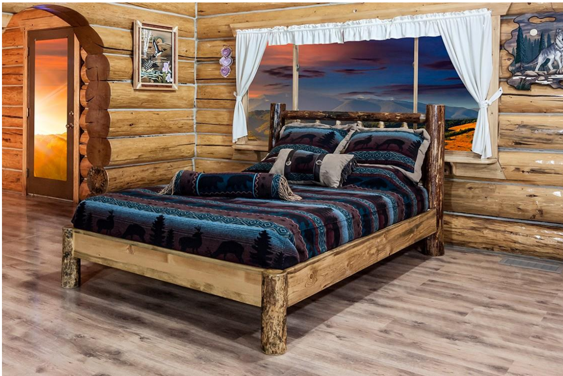
Glacier Collection Shown, Other Collections Similar